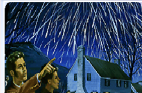
240,000 stars lit up the sky all at once in 1833!

*Note: This prophecy was fulfilled on November 13, 1833. Eyewitnesses reported 240,000 meteors all at once! The celebrated astronomer and meteorologist, Professor Olmstead, of Yale College, says: "Those who were so fortunate as to witness the exhibition of shooting stars on the morning of November 13, 1833, probably saw the greatest display of celestial fire works that has ever been since the creation of the world, or at least within the annals covered by the pages of history." -Our Lord's Great Prophecy, page 35.